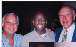
Jack Canfield & Mark Victor Hansen